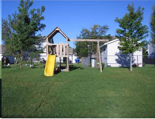
Custom Kids Playset