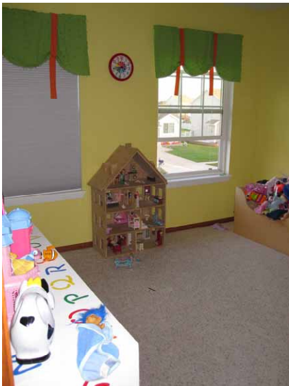
Bedroom #1 (12x13)