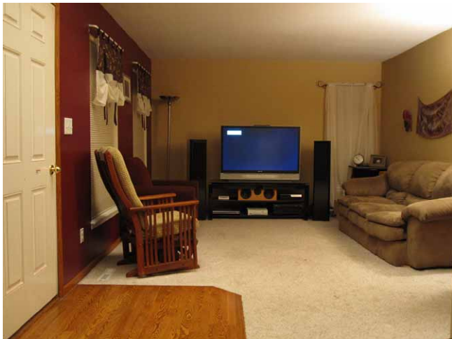
Living Room (14x17)