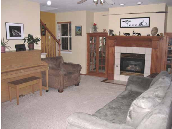
Family Room (13x18)